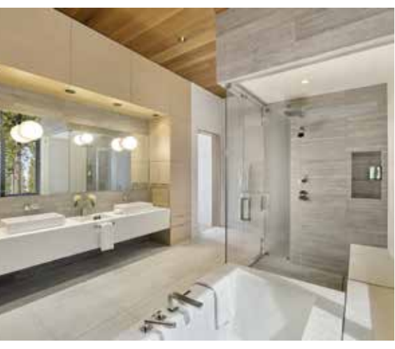
CLOCKWISE FROM TOP: An opening through a Pacific Ashler stone wall leads to the gathering room and dining area, where an open staircase of steel, glass and oak is set against a charred cedar wall | The lofty master bedroom features ample glass along with a precast concrete fireplace and a custom-designed wool wall | The luxurious master bath includes custom precast white concrete countertops, Artemide handblown glass wall sconces, a Wetstyle bathtub and porcelain tile throughout from SpecCeramics